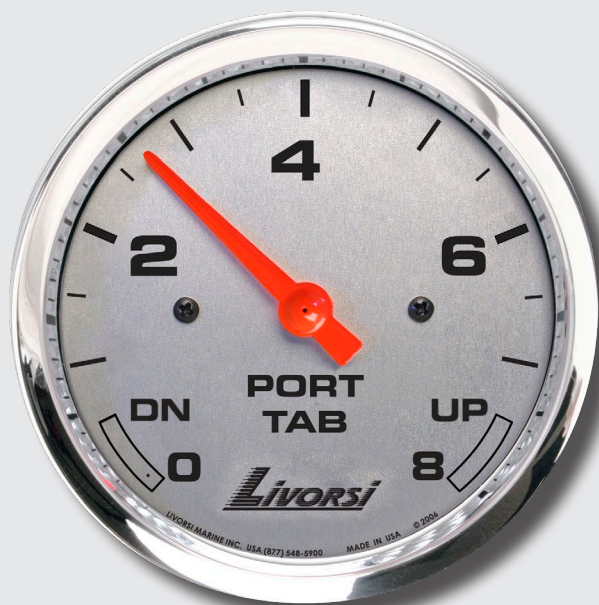
PART # PICTURED: DC5VPTTLPSSRR (PORT TAB, PLATINUM DIAL, & POLISHED SS RACE RIM)