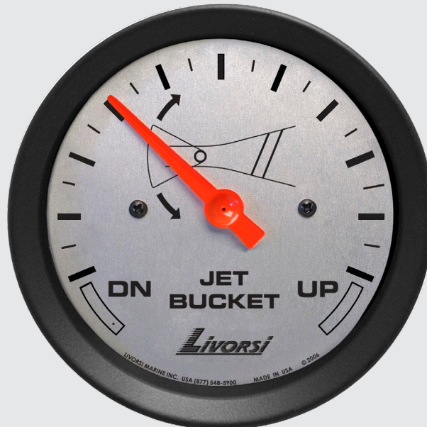
PART # PICTURED: DC5VJBPLBKRR (JET BUCKET, PLATINUM DIAL, & BLACK RACE RIM)