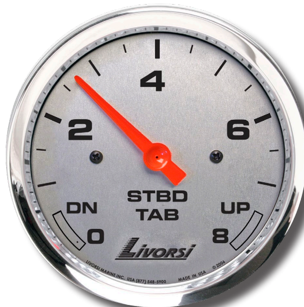
PART # PICTURED: DC5VSTTLPSSRR (STBD TAB, PLATINUM DIAL, & POLISHED SS RACE RIM)